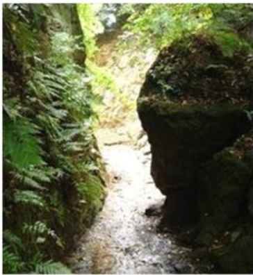
Nagoe Kiridoshi Pass

Zushi Station(JR Yokosuka Line)→(bus)→ Nagoe Kiridoshi→ Mandarado→ Okirigishi wall→ Hosshoji Temple→ Hisagi 5-chome bus stop