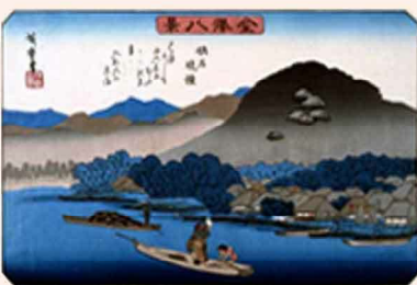
Evening Bell of Shomyoji Temple, by Utagawa Hiroshige, Kanagawa Prefectural Kanazawa-Bunko Museum

Kanazawa was a well-known scenic spot. In the late 17c., eight scenes were selected by a Chinese priest xin yue(心越), and were named as "Kanazawa Hakkei" (Eight Views in Kanazawa). A series of Ukiyoe, Eight Views in Kanazawa, by the famous artist Utagawa Hiroshige (1797-1858) attracted many people to the area, including literati, artists as well as tourists. One of the pictures, "Shomyo-no-Bansho" (Evening Bell of Syomyoji Temple), shows us the evening scene within the sound of Shomyoji's bell that still exists.