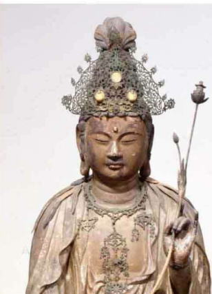
重要文化財 弥勒菩薩立像 称名寺蔵 Standing statue of Bodhisattva Maitreya (Important Cultural property, not open to the public)