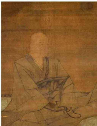
国宝 北条実時像 称名寺蔵 (神奈川県立金沢文庫保管) Portrait of Hojo Sanetoki (National treasure)