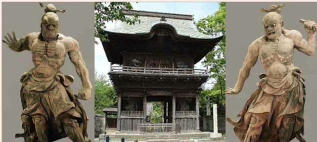
Standing Kongo-rikishi (Nio), sculpted in 1323, Shomyoji Temple, Important Cultural property

In Kondo, or the main hall, Miroku-Bosatsu-Ryuzo (Standing Bodhisattva Maitreya) has been enshrined as the principal image of the temple. Also, there are many other important cultural assets including mural paintings and Shumidan (pedestal). They are not open to the public. You can see the replicas in Kanazawa-Bunko Museum.