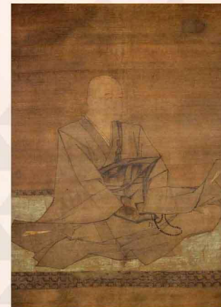
Portrait of Hojo Sanetoki National Treasure, Shomyoji Temple, in trust at Kanagawa Prefectural Kanazawa-Bunko Museum

The garden was designed to represent the Pure Land or Buddhist Paradise in the real world. It is said that the arched and flat bridges over the pond, Ajiga-Ike, connect this world to the future world, where the Buddha (Miroku-Bosatsu) is standing.