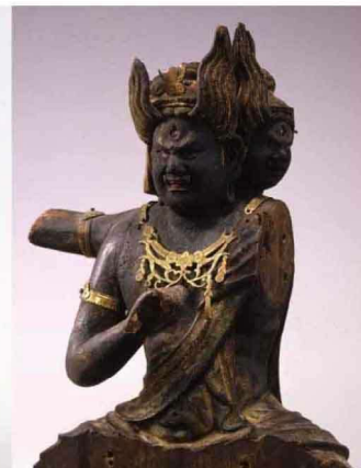
重要文化財 大威徳明王像 光明院所蔵 (神奈川県立金沢文庫管理) Seated Dainikku Myo-o (Vajrabhairava) (Important Cultural property, by Unkei)